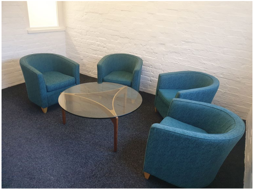
COMMUNAL MEETING AREA