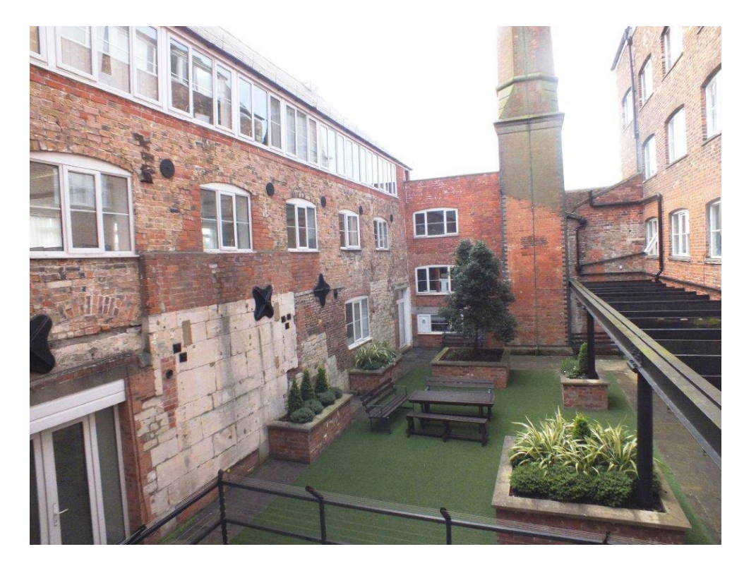
THE WHEELHOUSE COURTYARD